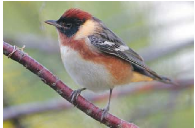
Bay-breasted Warbler: Greg Lavaty

Evaluate the conceptual model – Go back to the conceptual model(s) and assumptions from Step 4 and evaluate their performance in the face of real-world data. Do the monitoring results confirm the model and its assumptions, or support any of the hypothesized relationships? If a management action was taken, did it achieve the expected results? If not, there are several possible explanations: the assumptions were wrong, the management action was poorly chosen or poorly executed, the conditions at the project site have changed, information from monitoring was faulty, or these problems occurred in