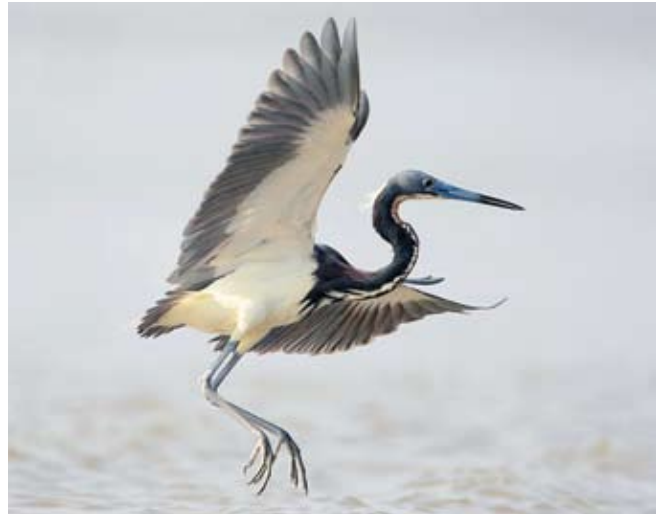
Tricolored Heron: Greg Lavaty

Provide access to data in accordance with legal and proprietary constraints – Monitoring data are expensive and time consuming to collect. Often, access to data must be limited to protect the locations of sensitive species, to safeguard proprietary interests, or for other reasons. Therefore, NADC has established formal accessibility guidelines for sharing data which provide several options for data owners to control access to centrally archived data: (1) not displayed; (2) shown only in certain visualizations; (3) shared with other bioinformatics efforts (e.g., Global Biodiversity Information Facility and Ornithological Information Systems ); (4) available with permission of the provider; and (5) unrestricted availability for download. While participation at the first level provides secure, off-site storage, participation in levels 2 through 5 accelerates the delivery of monitoring results to those who can use them for conservation.