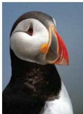
Atlantic Puffin