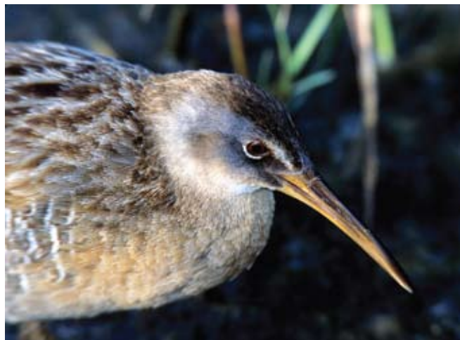
Clapper Rail: Ralph Wright

Identify appropriate analytical procedures – A variety of analysis methods can be used to estimate variables such as productivity, density, and occupancy (the proportion of an area occupied or the probability that an area is occupied by the species of interest). Likewise, numerous methods exist to model habitat and estimate trends. Thomas (1996), Nur et al. (1999), and Vesely et al. (2006) provide overviews of many standard analytical procedures, while selected references and useful links can be found online at http://www.nebirdmonitor.org . Consulting with a statistician or biometrician when selecting the appropriate analytical methods is always recommended.