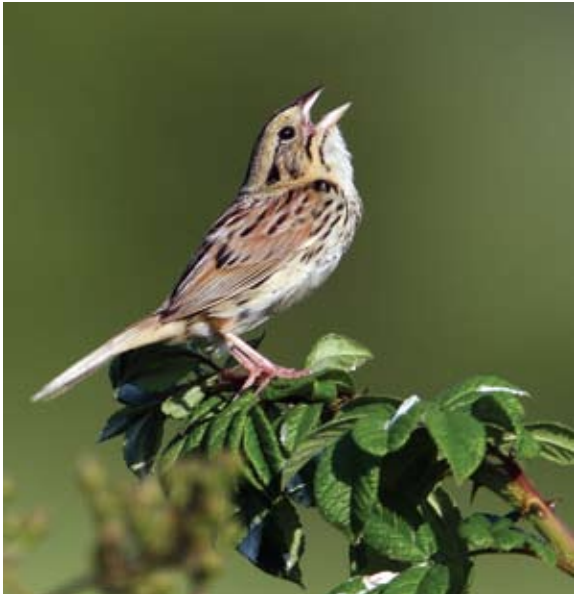
Henslow's Sparrow: George Jett

the stratification of a sample frame to a small number of properties because replication is a key requirement for inferring relationships. More strata therefore require larger sample sizes at greater cost in time and resources.