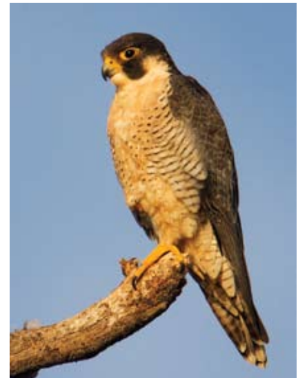
Peregrine Falcon: Peter LaTourrette, www.birdphotography.com