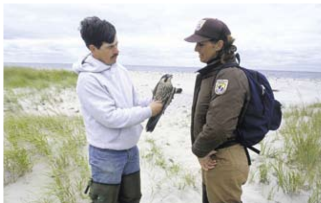
Researchers with Peregrine Falcon

Screen and train observers – Error rates can be reduced by screening volunteers and field technicians for required identification skill and hearing ability. Also, all observers should receive adequate training in data collection procedures to reduce the frequency of errors, especially those that occur while gaining familiarity with protocols early in the field season.