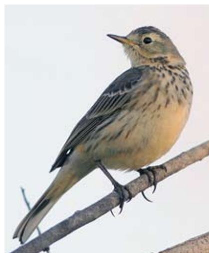
American Pipit: Greg Lavaty

Users specify the area and time frame of interest, as well as the datasets to be represented in the chart.