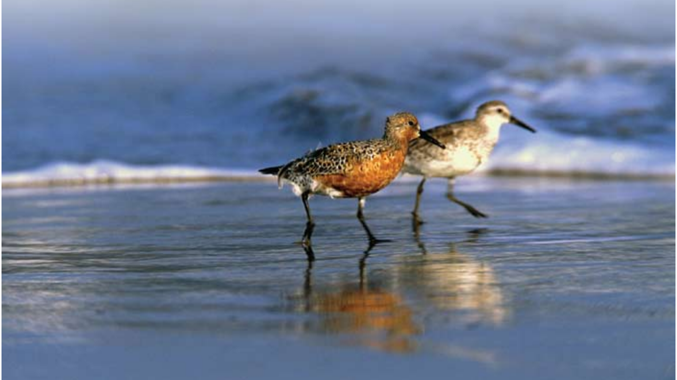
Red Knots: Ralph Wright

Land protection – New York City Audubon, the Trust for Public Lands, and the New York State Department of Environmental Conservation used the results of bird monitoring to guide the expansion of conserved lands within the Harbor Herons Complex. This area, which borders Staten Island, supports one of the largest breeding populations of colonial waterbirds in the Northeast.