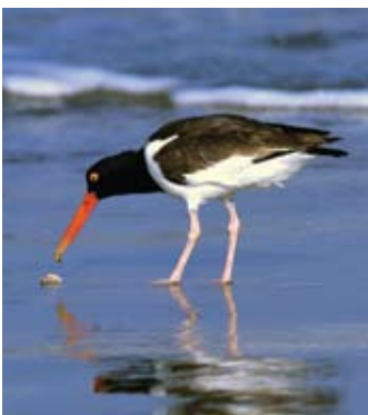
American Oystercatcher