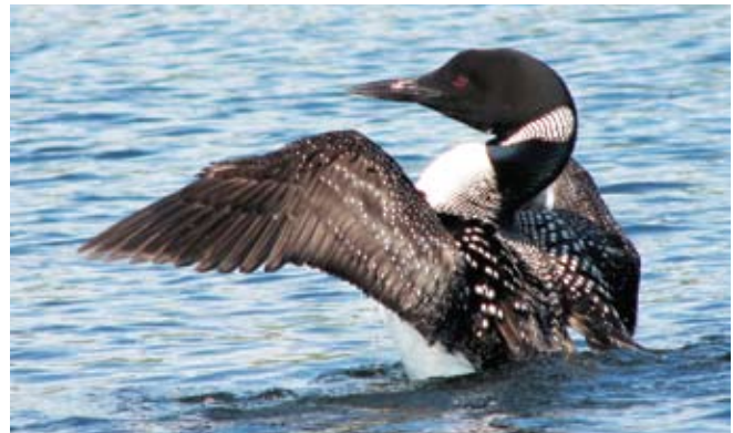
Common Loon