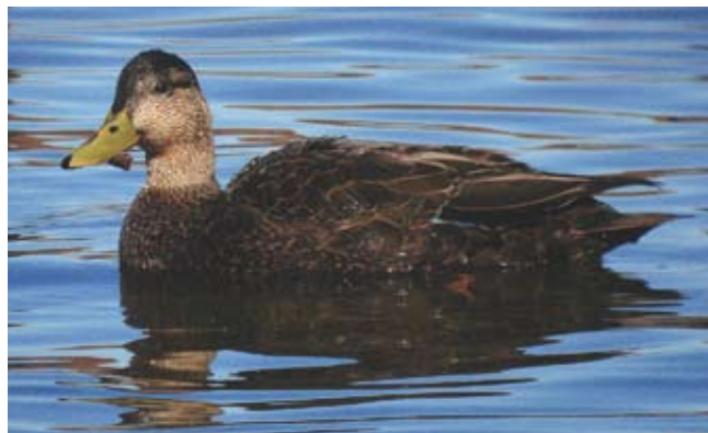
American Black Duck: Ken Rosenberg

Identify and consult stakeholders – Defining the problem will help identify stakeholders who need to be engaged in assessing its scope, setting a conservation goal, and eventually pursuing that goal with tools built from monitoring data. Biologists who design and implement monitoring programs are rarely in the position to dictate management or conservation strategy. Terms are more often set by policy makers, regulatory agencies, managers on the ground, and land protection specialists, based on