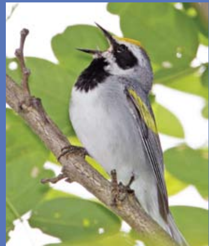
Golden-winged Warbler: George Jett