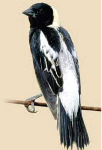
Bobolink

trained facilitator, the technique may be particularly well suited for navigating complex or contentious issues. However, SDM may not be suited to all circumstances. Some successful conservation professionals prefer more intuitive approaches to decision-making and trained facilitators are not widely available. Nonetheless, SDM warrants full consideration as a formal process for making decisions related to the monitoring and management of bird populations.