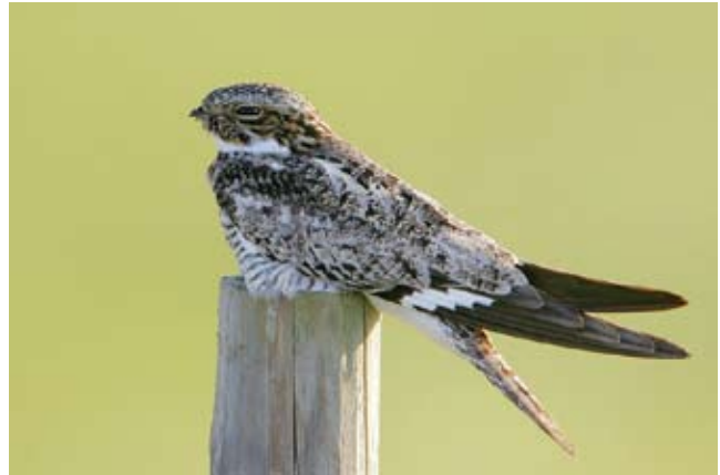
Common Nighthawk: Greg Lavaty

field on handheld electronic devices or in the office from hardcopy field forms, minimizing error is very important. Quality control can range from use of simple data filters to flag entries that do not fall within an acceptable range, to the more exhaustive approach of entering the data twice and comparing the two datasets to identify errors. Quality control measures that fall somewhere between these extremes are probably most cost-effective and more widely used. “Look-up tables” that provide a limited list of categorical variables and data ranges that limit the scale of continuous variables are a first line of defense against most typographical errors. Data entry forms, especially those that resemble field sheets, also ease the burden of transferring data from hard copy to digital format and provide a means for visual comparison. An additional consideration to minimize error is to have field staff enter their own data. Field personnel can quickly spot a mistake that would go unnoticed by a naive data entry technician. Field forms that provide a space for comments are useful in clarifying anomalous records and further reducing mistakes in data entry. Finally, someone familiar with the data collection protocol should screen all entered data for errors. This provides a level of quality control that is