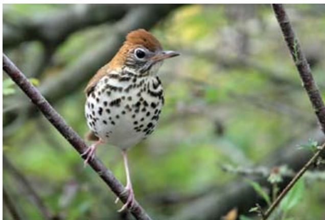
Wood Thrush: Greg Lavaty

Build on monitoring assets that are fundamentally sound – Exercise caution in selecting an existing program or protocol because deficiencies in design and implementation are widespread. To assess the suitability of available survey options, use the online monitoring evaluation tool developed by Southeast Partners In Flight ( http://www.sepif.org ). This interactive tool describes appropriate uses of survey data based on user responses to a comprehensive set of questions. It also provides a list of potential biases and scores for regional coordination, management relevance, and data security.