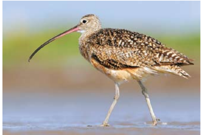
Long-billed Curlew

Despite numerous conservation success stories, northeastern birds still face threats of increasing magnitude and complexity. Rapid development, invasive species, climate change, and a host of other issues have placed many of the Northeast's varied habitats and associated birds at risk. However, the collective capacity to monitor and react to threats also has grown. Today, the region is home to more conservation organizations, more bird monitoring programs, and more skilled observers than ever before. In recent years, they have accumulated vast stores of data that can help establish population targets and strengthen survey designs. Similarly, methods to collect, analyze, and exchange monitoring information have advanced considerably. However, if these improved monitoring resources are not used in the most efficient