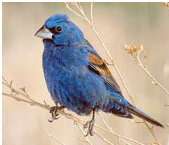
Blue Grosbeak: Peter LaTourrette, www.birdphotography.com

Monitoring programs that build and test alternative models are better equipped to distinguish the importance of individual conservation activities. In such cases, it can be useful to assign measures of confidence to each alternative. For example, three models could be weighted 0.5, 0.25, and 0.25, respectively, if the first model seemed twice as likely as the other two to reflect real dynamics. These “model-specific probabilities” can be adjusted as monitoring results come to support one hypothesis over another (Nichols and Williams 2006) and can then be