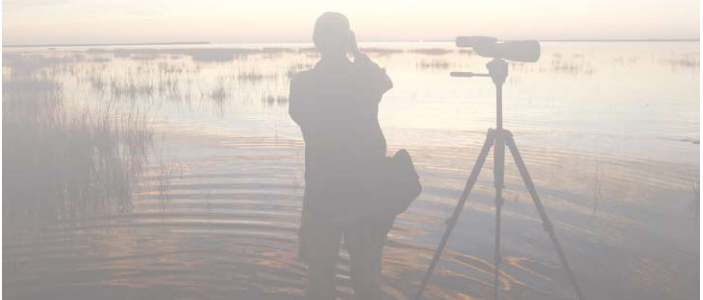
Marsh bird monitoring: © Bryan Pfeiffer

way, the opportunities they represent will have been squandered. Recognizing these assets and aligning them behind clear and unified goals will be critical to successful bird conservation in the Northeast. Success also depends on garnering the support of agency administrators and other decision makers. A carefully planned, cooperative approach worked for Peregrine Falcons and can work for other species at risk today. Attention to the details summarized in this handbook should help improve the effectiveness of bird monitoring programs in the region. Maintaining the Northeast's rich natural heritage depends, in part, on building a legacy of coordinated bird monitoring that provides crucial information to conservation planning, implementation, and decision making processes.