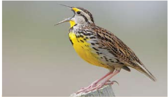
Eastern Meadowlark: Greg Lavaty

Effects monitoring uses covariates to link changes in bird populations to changes in the environment. This approach can help explain why populations rise or fall. Monitoring effects also can aid in projecting impacts of development, climate change, and other potential threats.