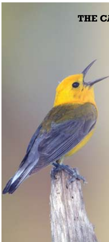
Prothonotary Warbler: Greg Lavaty

Unique information needs often can be accommodated by intensifying effort within certain land units or by customizing protocols within a common monitoring framework.