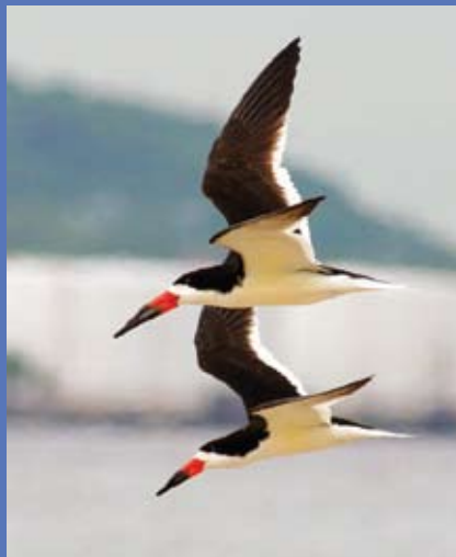
Black Skimmers: Tom Grey